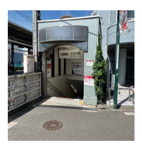
Kamikitazawa Station

a mikitazawa has wonderful shops that are loved by the local community. One of them is a bagel shop called Kepo Bagels. A bagel is a ring-shaped bread