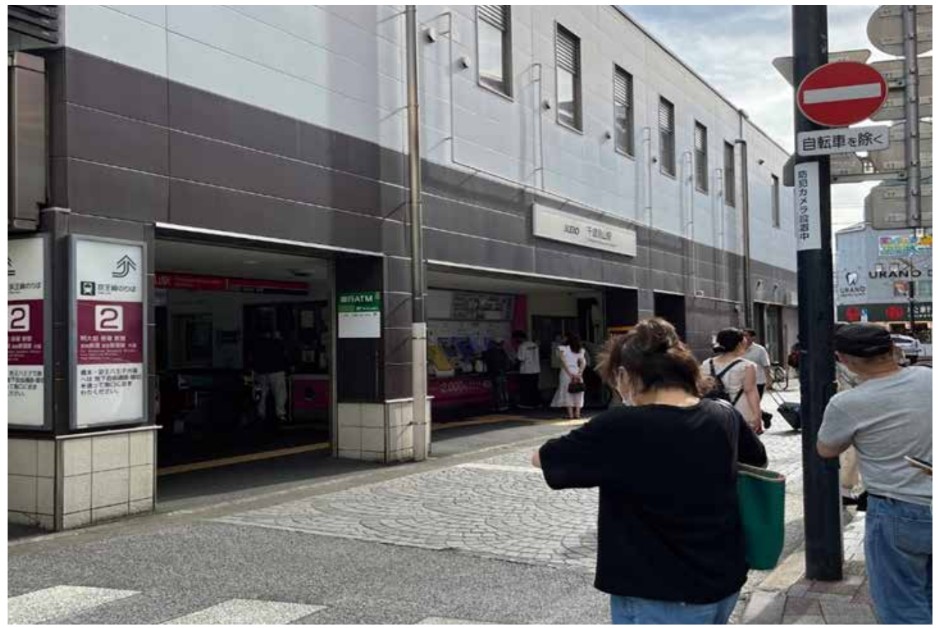
Chitose-Karasuyama Station

hitose Karasuyama has faced the challenges. At first, Chitose-Karasuyama Station was established in 1929 after changing its name from Karasuyama Station. The problem at Chitose Karasuyama is that Chitose Karasuyama has ``railway crossings that rarely open". This railroad crossing is the "Roka Park Level Crossing No. 5" adjacent to Chitose Karasuyama Station. The total time this railroad crossing is open is very short, for 4 minutes and 25 seconds per hour, though it opens relatively frequently, 19 times per hour. "Roka Park Level Crossing No. 5" has the problem with that, so the number