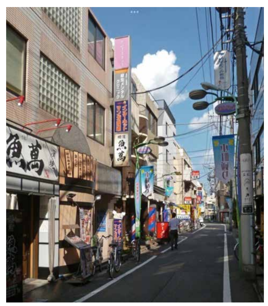
Kyodo Honmachi Street

yodo is a charming town located in Setagaya Ward, Tokyo. This area has a special atmosphere, a perfect blend of tradition and modernity. While ancient landscapes and culture are still exist and well, new trends and ideas are also emerging one after another.