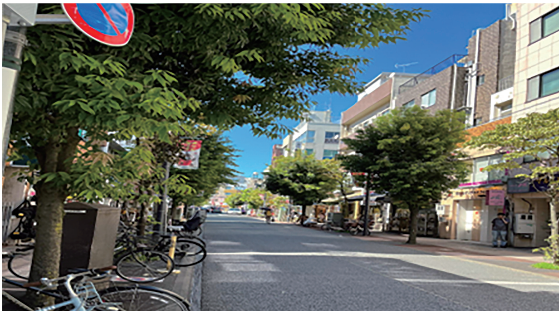
Chitose Karasuyama with its lively streets