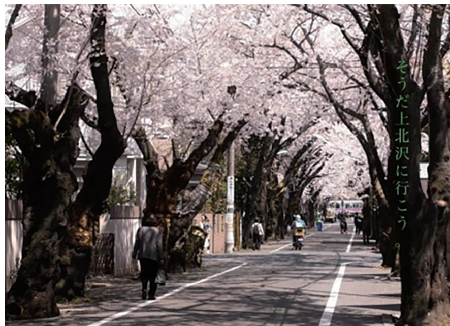
Poster of Kamikitazawa with beautiful nature