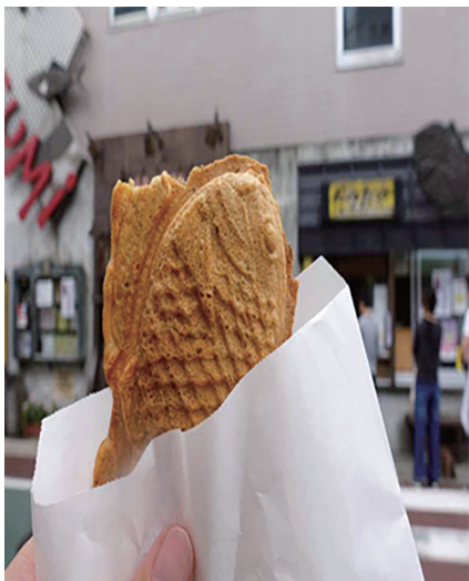
Taiyaki / Photo by Tatsumiya

The six towns in Tokyo suburb dealt in this newspaper may have similar cityscape; however, each have unique culture and tradition which can only be noticed with exploration. Each article of the Nissaku Times explores the towns, focusing on the benefits that the locals enjoy and difficulties that the town faces.