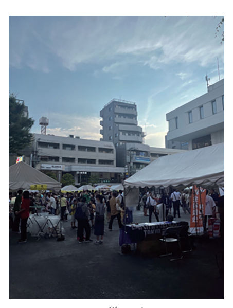
Shopping street events